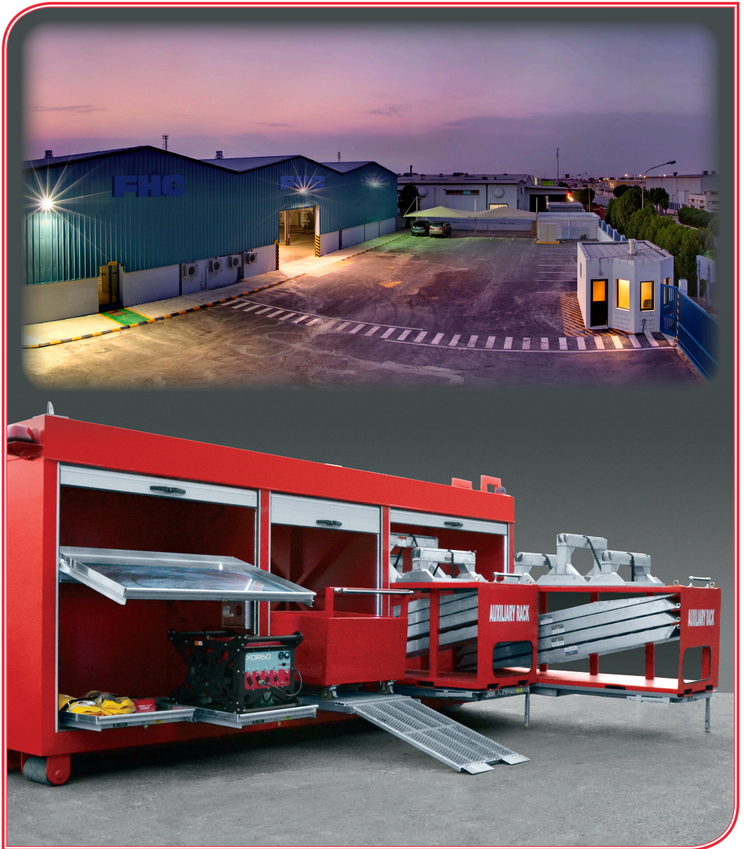
FIRE EQUIPMENT CONTAINER