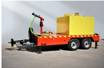
Foam Monitor Trailer

Foam Monitor Trailer are used for continuous generation of large volumes of foam Solution and it is capable of large volume discharge to elevations never attained by conventional equipment to provide fire suppression, cooling, personnel protection, toxic gas dispersion and more.