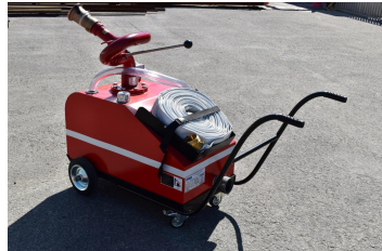
Quick Attack Foam Cart

Most fire incidents can be resolved by quick decisive action and the effective application of the correct extinguishing medium. Chief Fire Quick Attack Cart does the same for any hydrocarbon or any flammable chemical spill fire at any warehouse or petrochemical plants.