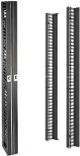
VERTICAL CABLE ORGANIZER