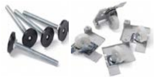
CASTORS & LEVELING FEET