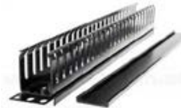
HORIZONTAL CABLE ORGANIZER