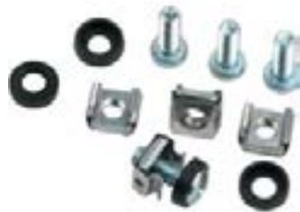
CAGE NUTS WITH SCREW WASHERS