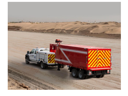
Hose Recovery Vehicle

FHC engineering team has created a versatile combination using the FHC custom built light rescue body and various trailer units. The chassis mounted equipment body and trailer body are all constructed of aluminum using custom designed extrusions for a corrosion free body.