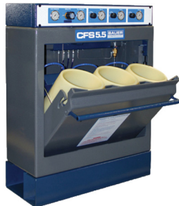
Breathing Air Systems