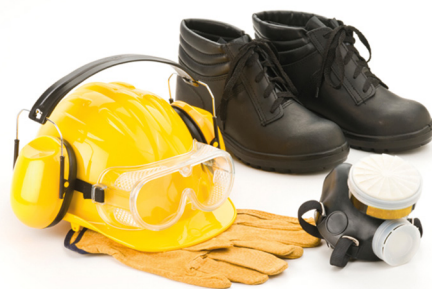
Fire Fighting Equipment