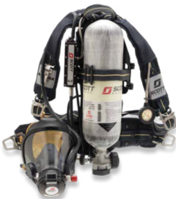
Breathing Air Systems